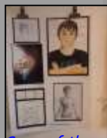
Some of the amazing work on show. Background as in bottom left.