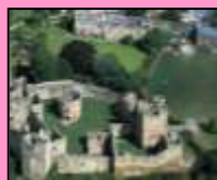
Ludlow Castle, Shropshire