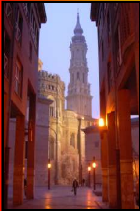
Zaragoza in the evening